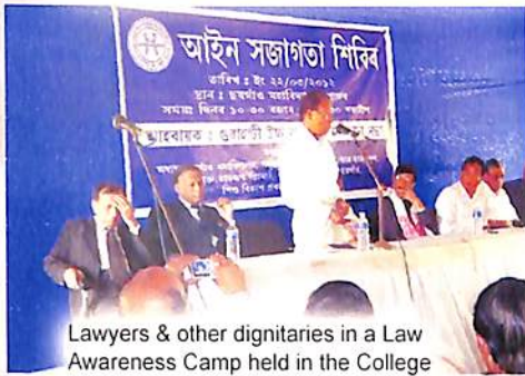
Lawyers & other dignitaries in a Law Awareness Camp held in the College