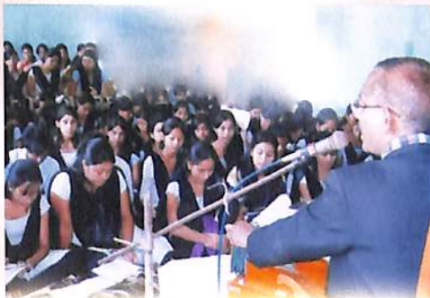
Noted singer Pankaj Bordoloi in a workshop on 'Jyoti Sangeet'