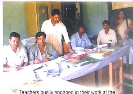
Teachers busily engaged in their work at the G U TDC Examination Zone in the College