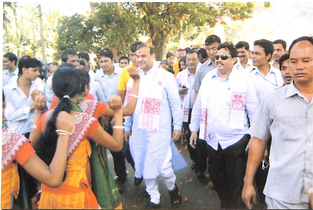
Proceeding for inauguration of rennovated "Champakjyoti Prekshagriha"