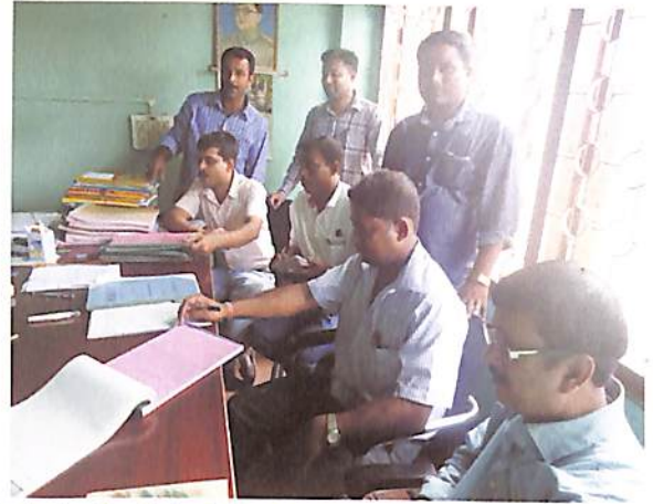
Teachers at the G.U. (TDC) Evaluation Zone in the College