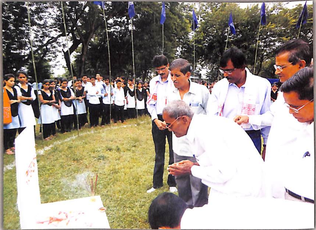
A tribute to the eternal souls...