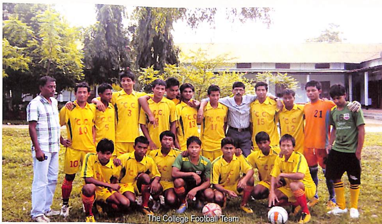
The College Football Team